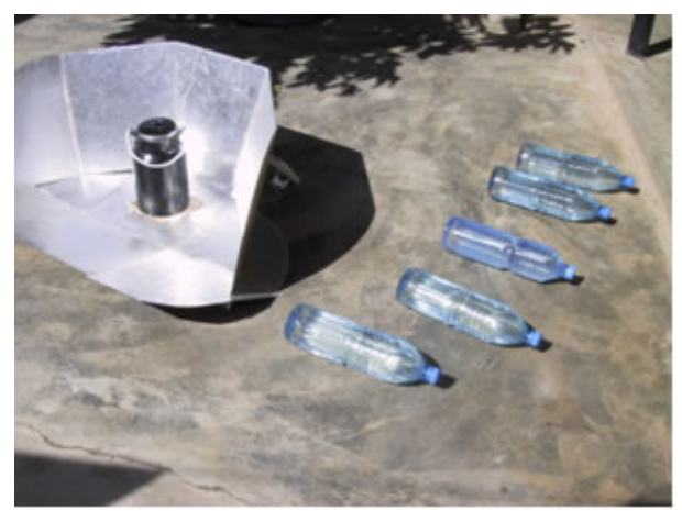
Fig. 5 Comparing Cookit heating with SODIS with local water in Meatu District, Tanzania.