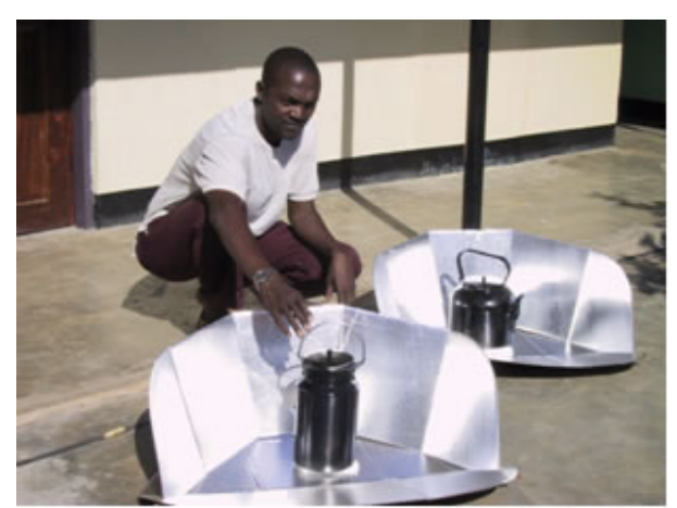
Fig. 3 Pasteurizing contaminated water in a Cookit, Meatu District, Tanzania.