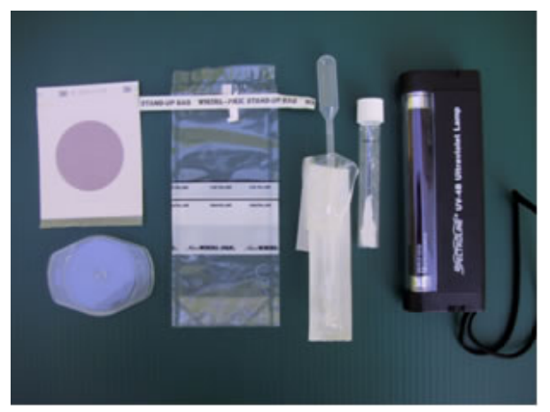
Fig. 11 Items used in portable microbiology lab. Petrifilm and spreader, WhirlPak, sterile pipette, Colilert, portable UV light.