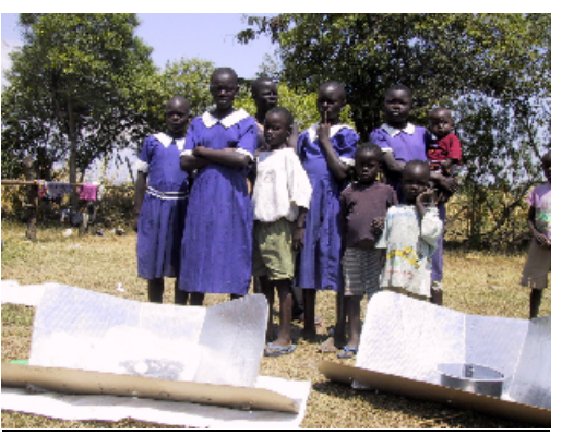
Fig. 9 Using Cookits for cooking (left) and pasteurizing contaminated water (right) in Sunny Solutions project, Nyakach, Kenya.