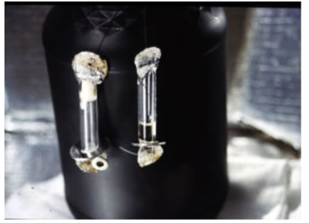
Fig. 2 Water Pasteurization Indicator. When water heats to 65°C, the wax melts and falls to the bottom of the WAPI, indicating the water has been pasteurized.