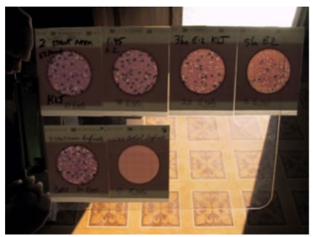
Fig. 6 Results of SODIS vs Cookit. E. coli killed in 2 hr with Cookit heating. E. coli survives 5 hr of SODIS exposure.