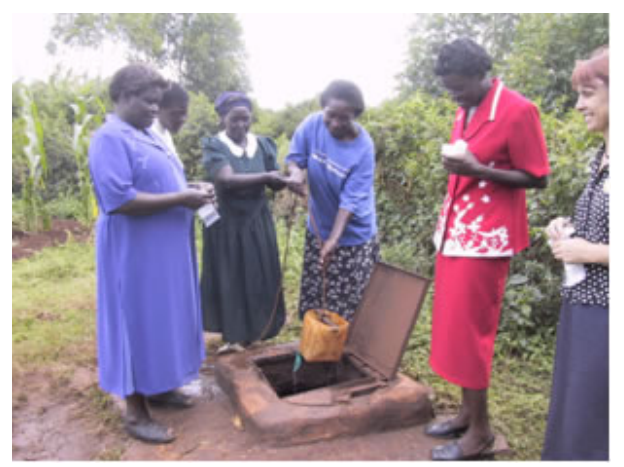
Fig. 7 Collecting water from a shallow well, Nyakach, Kenya, for water testing.